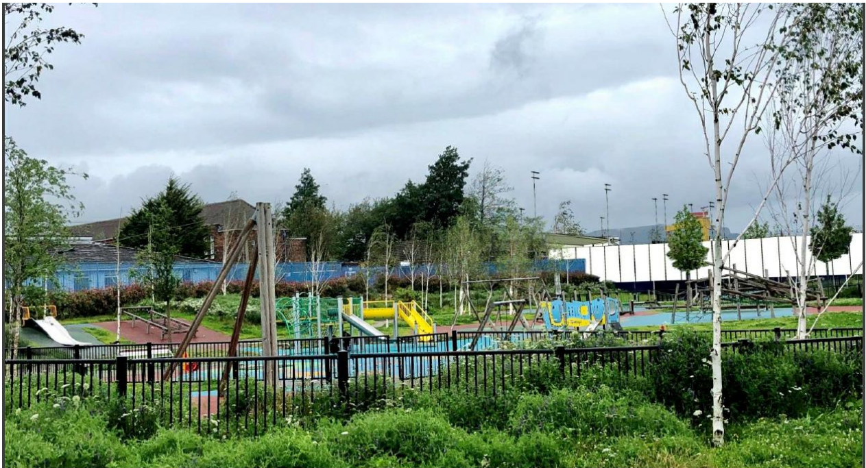
View 2 - from the greenway looking north towards Avoneil School